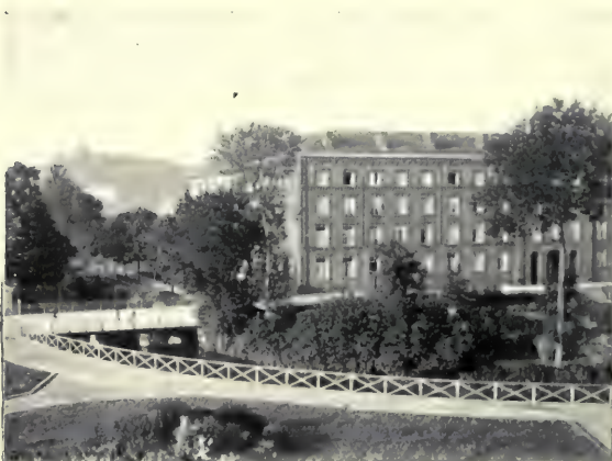
Fig. 2. THE ANDRÉ GODIN STREET COURT.

I N the pages immediately following we shall deal chiefly with the principal group of dwellings, including the left wing, the central court, and the right wing. The two blocks afterwards built, in Sadi-Carnot Street and André Godin Street, were